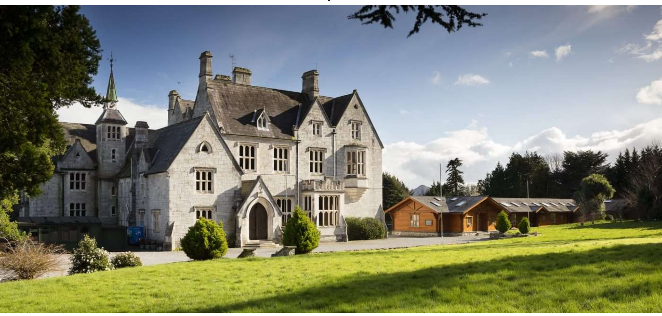
John Scottus Secondary School Uniform Brochure